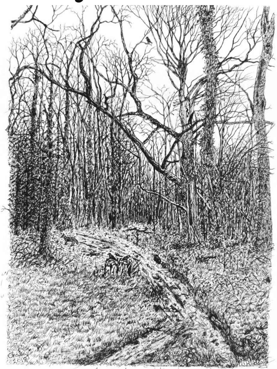
The woods in winter