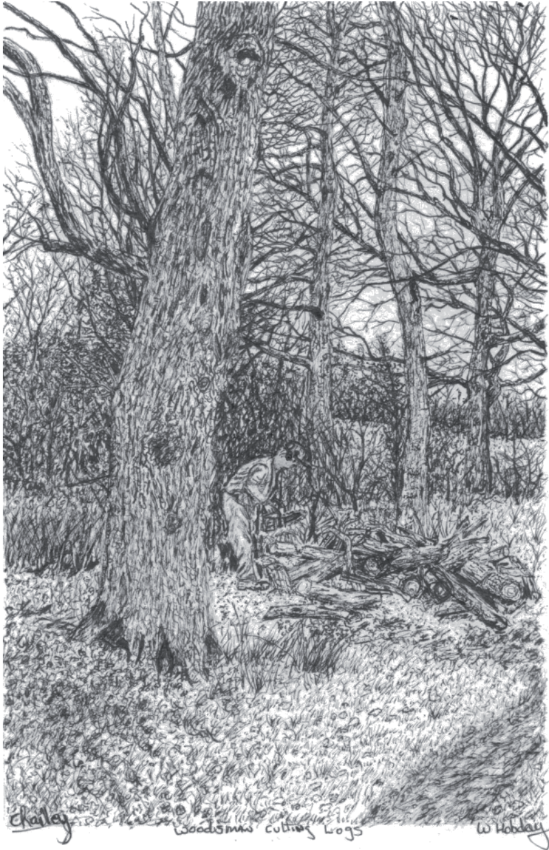
Chailey Woodsmen cutting logs W. Hobday