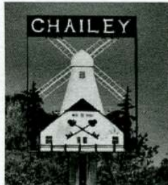
CHAILEY PARISH COUNCIL