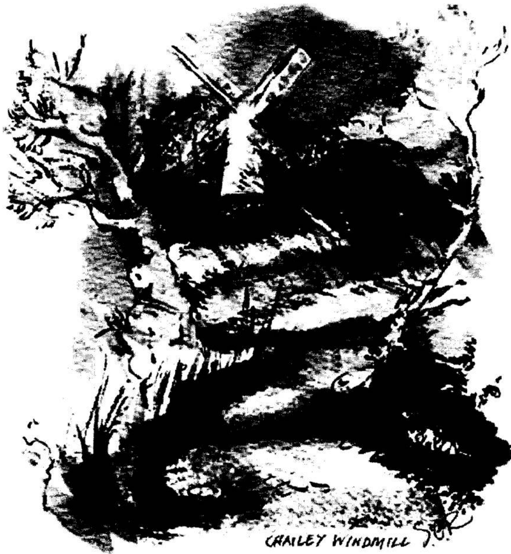
CRAILEY WINDMILL J.S.